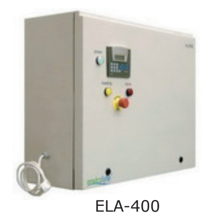
• Efficient: reduced sterilization contact time